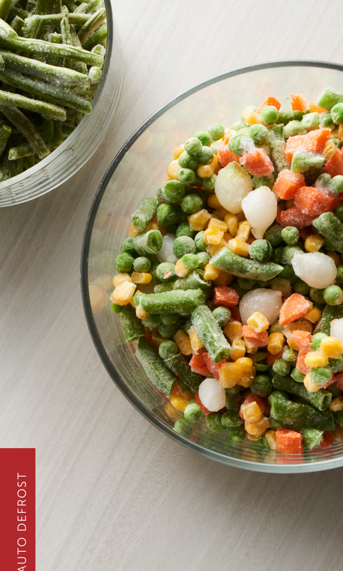
KEEP WARM and AUTO DEFROST